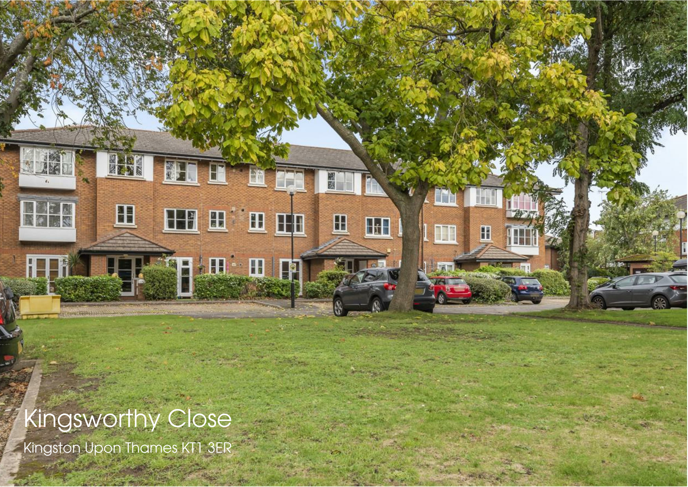
Kingsworthy Close Kingston Upon Thames KT1 3ER